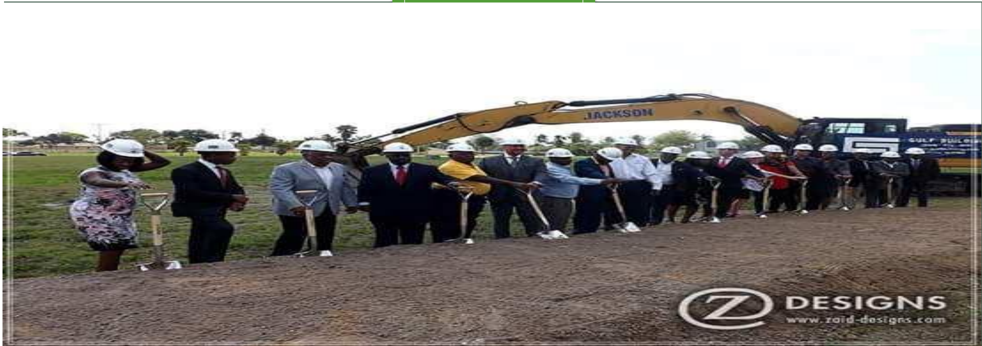
Groundbreaking for Heron Estates Senior, May 2018