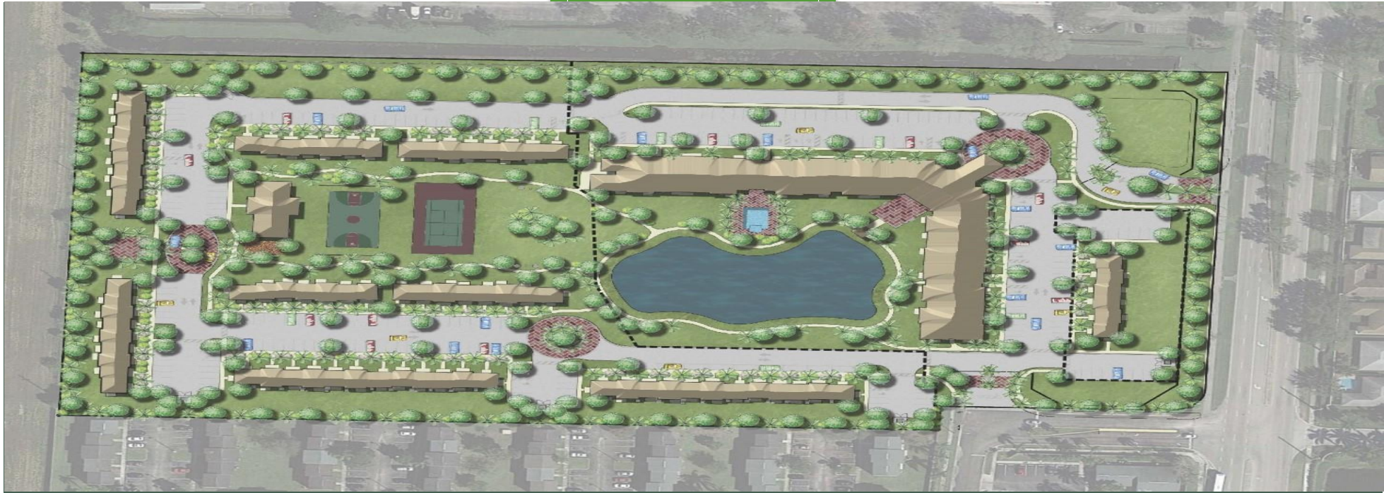
The Full Plan: Heron Estates