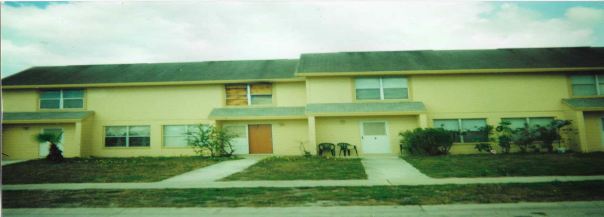
Ivey Green Village was built in 1976.